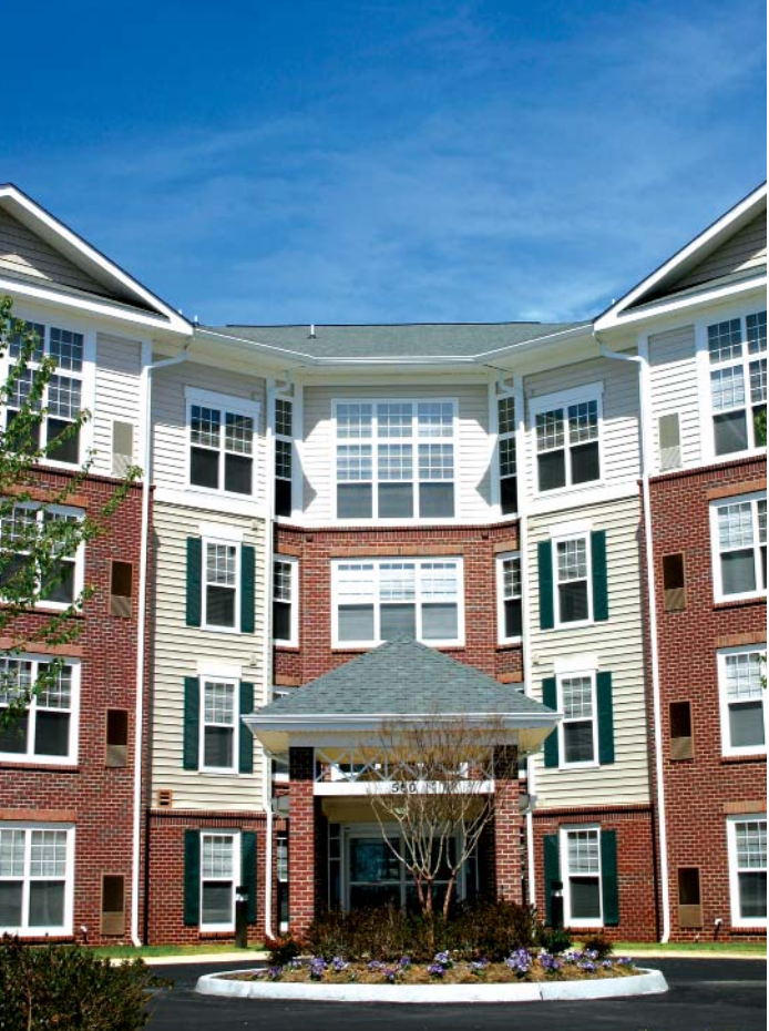
The Atlantic at Charter Colony is one of Midlothian's newest senior living facilities.