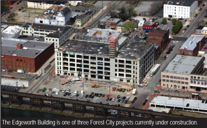
The Edgeworth Building is one of three Forest City projects currently under construction.

Cutter's Ridge at Tobacco Row consists of 12 high-end townhouses. The project will offer a rare feature for newly constructed