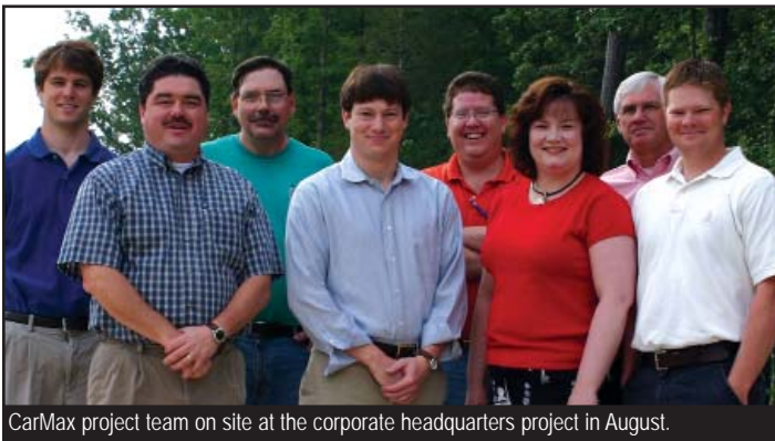
CarMax project team on site at the corporate headquarters project in August.

KBS met construction objectives in the Leadership in Energy and Environmental Design (LEED) Green Building Rating System® and surpassed benchmarks for recycled and locally manufactured materials used in the project. LEED is a voluntary program developed by the U.S. Green Building Council that rates a building's level of environmentally friendly features based on an industry-wide consensus of best building practices. The criteria address land use, environmental safety, ecological impact and resources conservation.