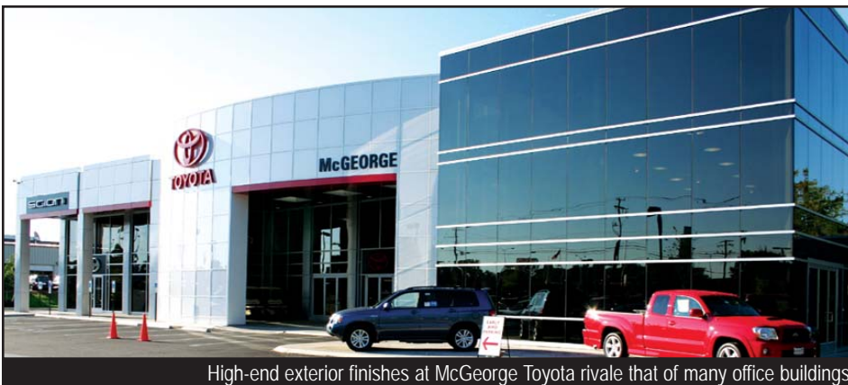
High-end exterior finishes at McGeorge Toyota rival that of many office buildings