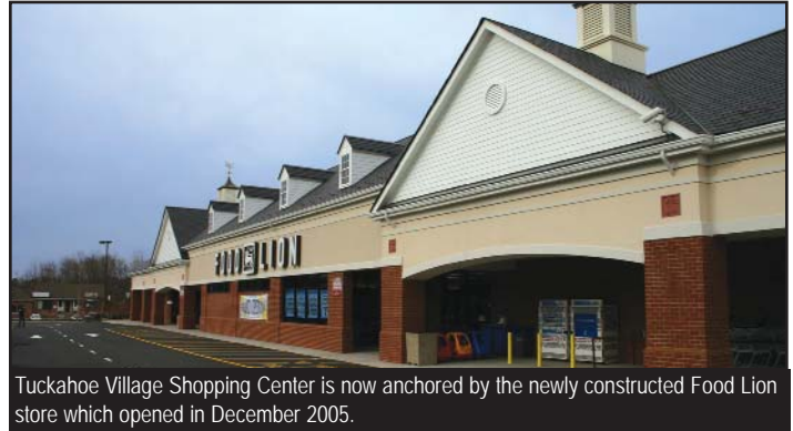
Tuckahoe Village Shopping Center is now anchored by the newly constructed Food Lion store which opened in December 2005.