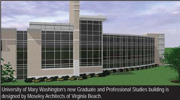
University of Mary Washington's new Graduate and Professional Studies building is designed by Moseley Architects of Virginia Beach.