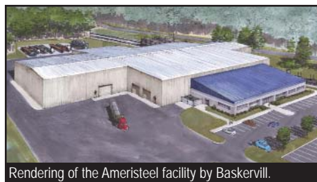
Rendering of the Ameristeel facility by Baskervill.

Ameristeel Manufacturing Facility, King George County