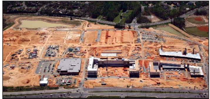
The expansive 115-acre West Broad Village site boasts a prominent location in Short Pump.

The project is owned by Unicorp National Developments, Inc. and designed by Antunovich Associates. In addition to orchestrating the construction of West Broad Village, KBS is also the Construction Manager overseeing the site development of the project.