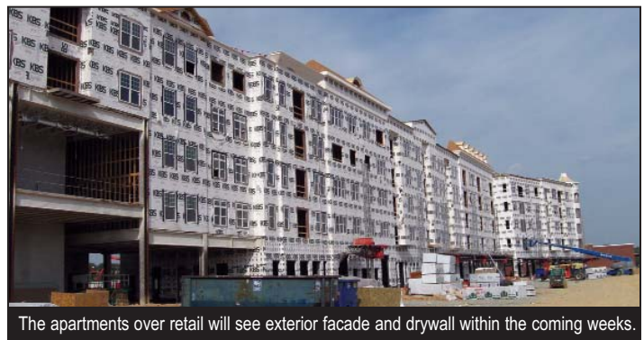
The apartments over retail will see exterior facade and drywall within the coming weeks.