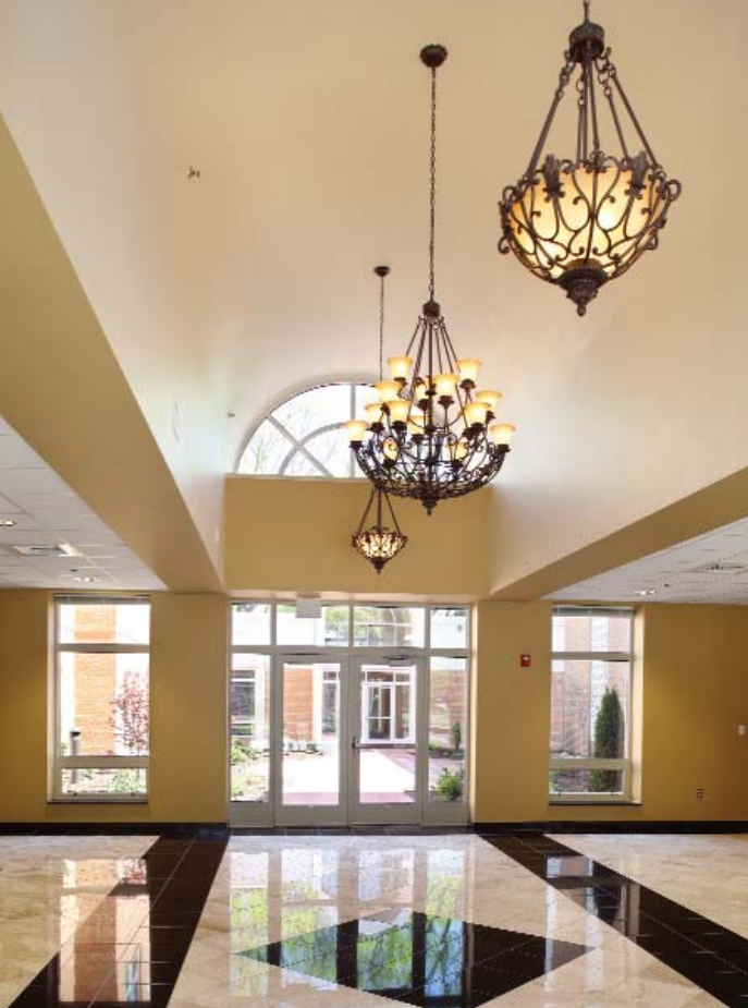
Ornate fixtures and tile decorate the Cathedral's interior which overlooks a landscaped courtyard.