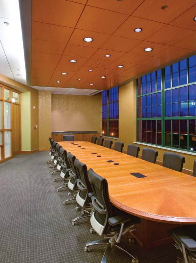
Hirschler Fleischer's conference room in the Edgeworth Building on Tobacco Row offers spectacular views of the James River.

Visit us on the Web at: www.kbsgc.com 8050 Kimway Drive ■ Richmond, Virginia 23228 ■ 804.262.0100