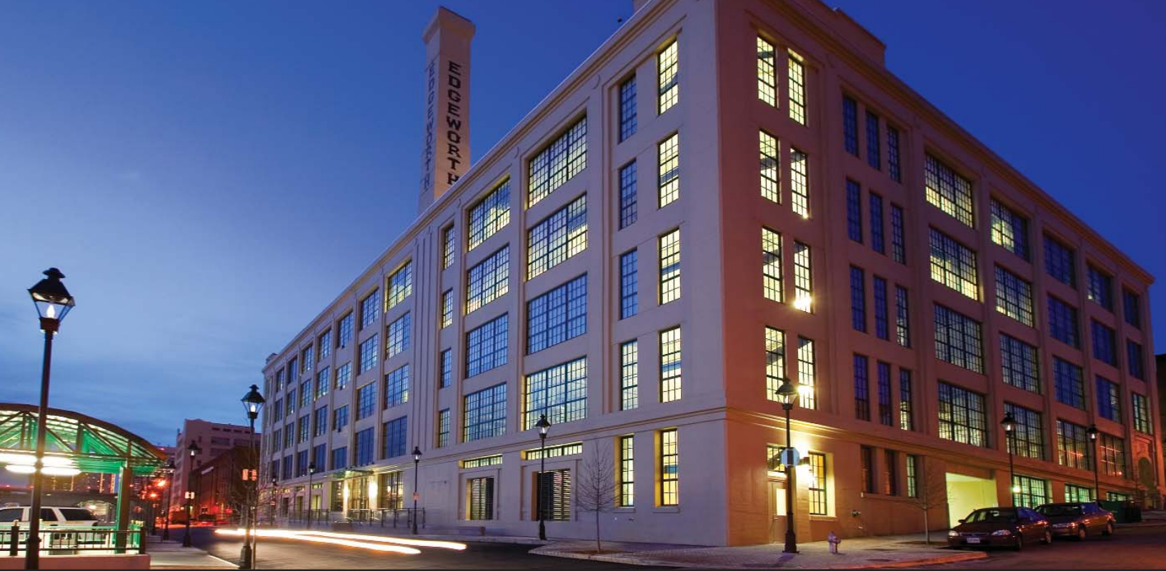
Hirschler Fleischer law firm anchors the 166,000-square-foot Edgeworth Building on Richmond's Tobacco Row.