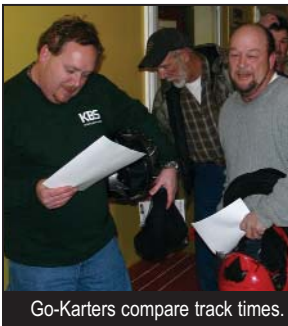
Go-Karters compare track times.

At Sur La Table, the goal for a group of 14 ladies was to create a gourmet Southern menu without poisoning their co-workers.