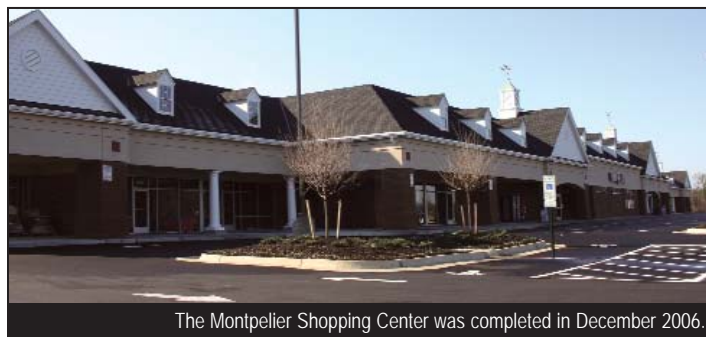
The Montpelier Shopping Center was completed in December 2006.